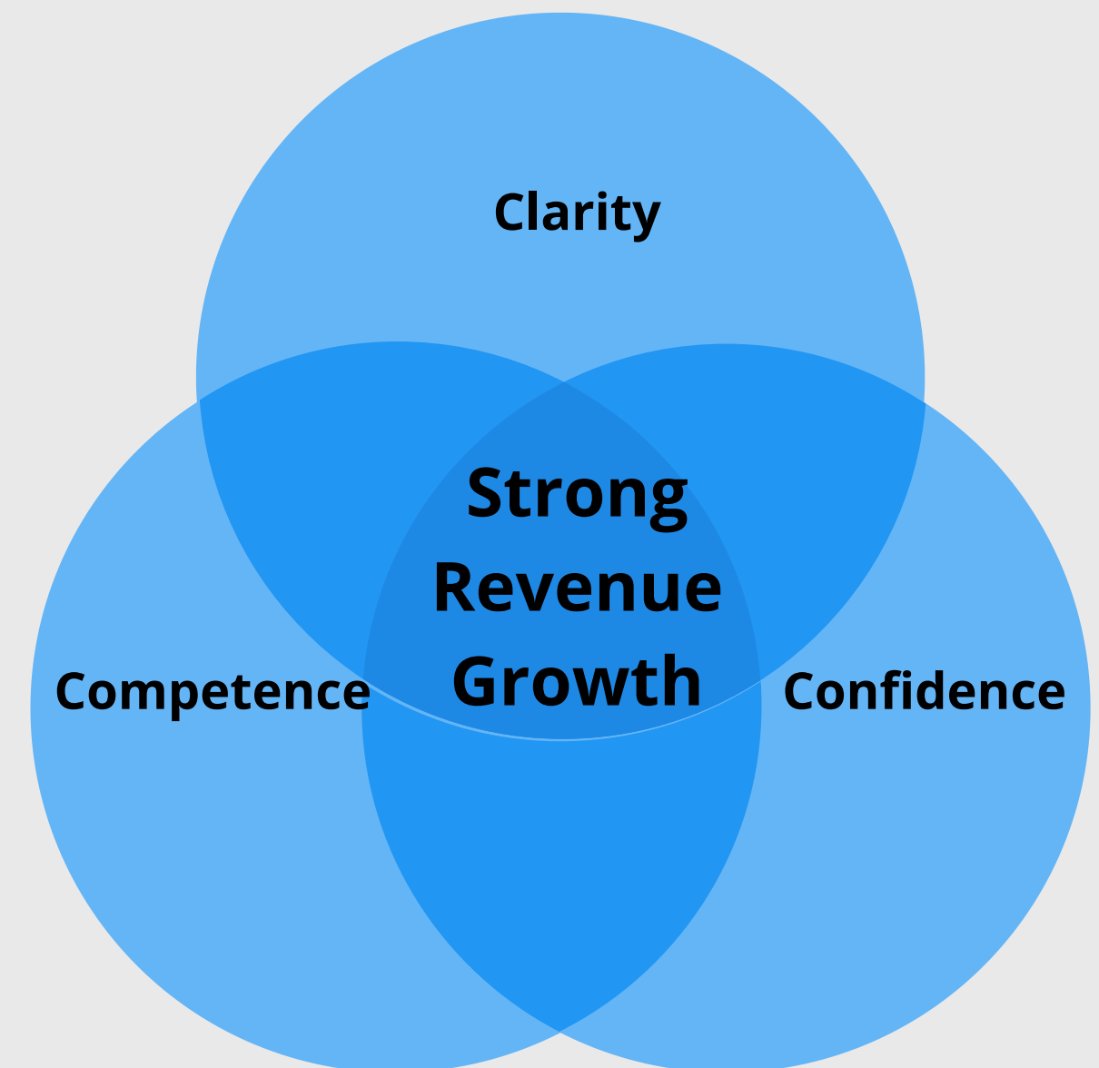
Components of Strong Revenue Growth